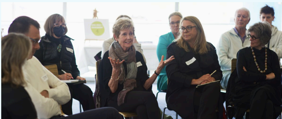
Robust discussion at Future Forums have been important in the development of the City Heart.

Visit www.yoursay.ccc.tas.gov.au/cityheart to find out how to get involved in this stage of consultation. There will be a survey available throughout the period, and many opportunities to see the concepts and talk to staff face-to-face.