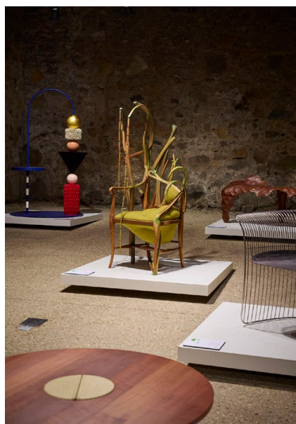
2021 Clarence Prize exhibition.

ENTRIES FOR THE CLARENCE PRIZE ARE NOW OPEN, WITH OVER $20,000 IN PRIZE MONEY TO BE AWARDED FOR EXCELLENCE IN FURNITURE DESIGN.