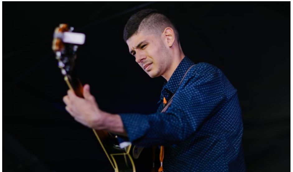
The 2023 Clarence Jazz Festival showcases a diverse lineup of local and interstate talent, exciting collaborations, hyper-local food and beverages, and activities for all ages.

This year will also see an expanded focus on Tasmanian food and beverage options at the