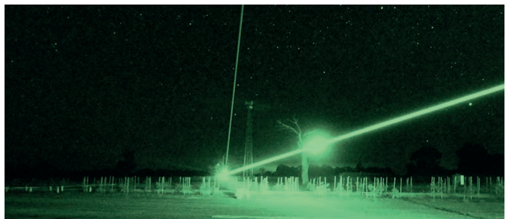
An example of artist Robin Fox's laser installations.

"One of our key strategic goals as a council is to encourage creativity, innovation and