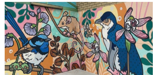
Rosny Early Learning Centre's new mural.

"I like the wren it, it's pretty," he said.