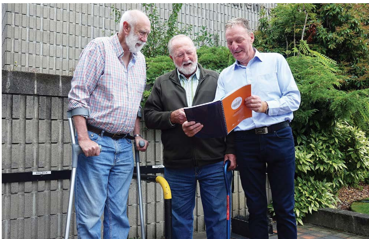
Some of council's Disability Access Advisory Committee