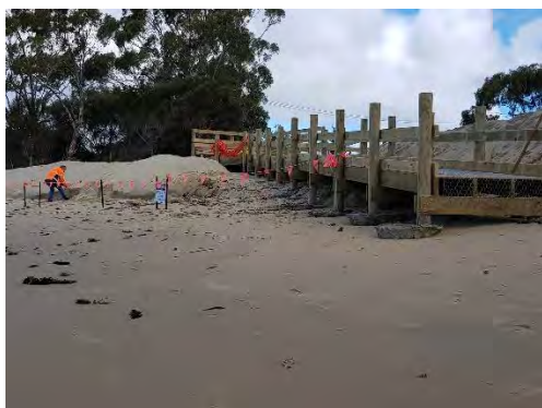
Lauderdale Disability access ramp to Lauderdale Beach