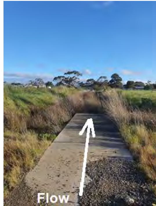
Lauderdale stormwater main channel