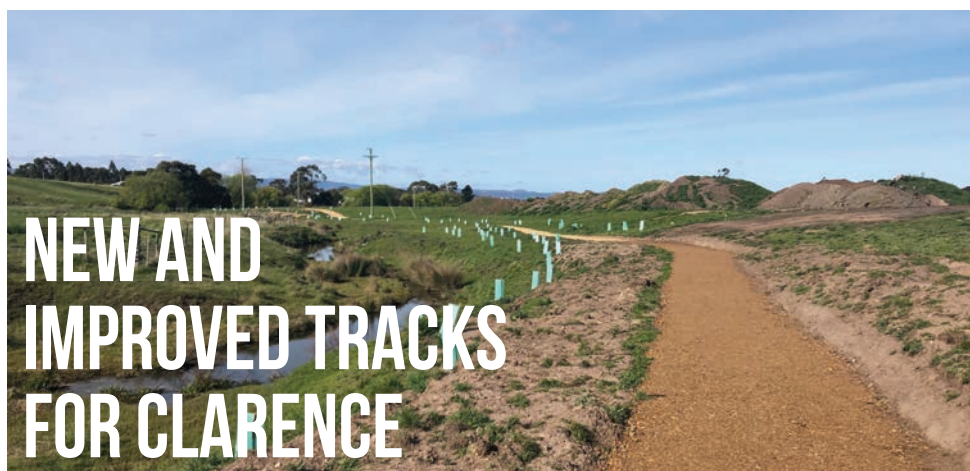
Barilla Rivulet track upgrade.

The Risdon Vale Oval Community Sports Pavilion project is delivered with the assistance of a $200,000 grant from Sport Australia through the Community Sport Infrastructure Program and $80,000 through the Department of Communities Sport and Recreation Major Grant Program.