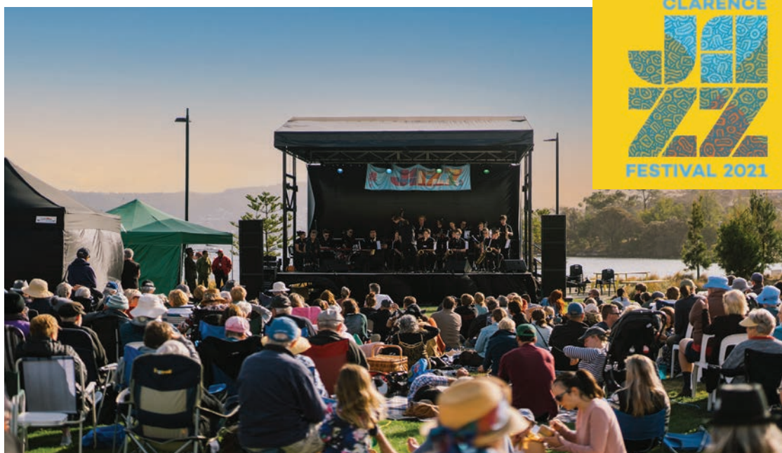
A crowd enjoying The 2020 Clarence Jazz Festivals 'A Big Day at Kangaroo Bay'.

"It is wonderful to be able to support Tasmania's live music scene by enjoying fabulous Jazz performed by the best