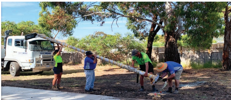
There were 23 new light poles installed at the Clarendon Vale Community Park last month.