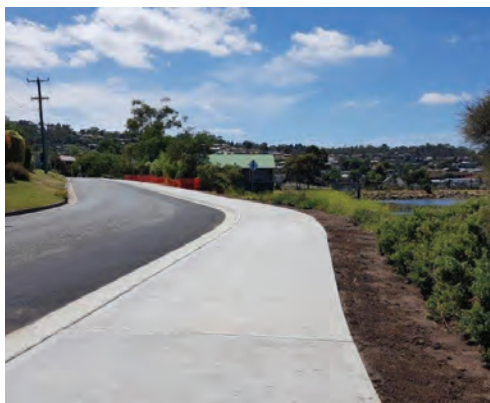
A section of the newly constructed shared path at Lindsfarne.

These works form part of an overall plan to extend and improve the Clarence Foreshore