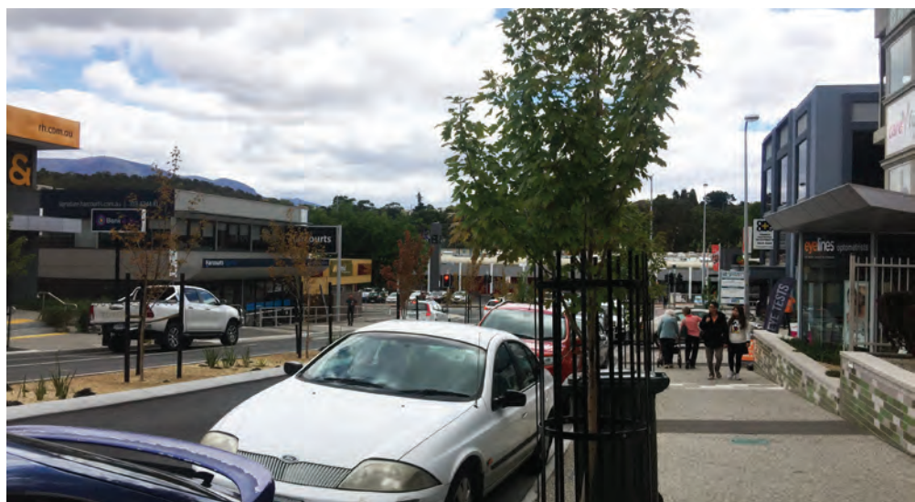
Recent upgrades to Bayfield Street in Rosny Park.

The recent upgrading of the Bayfield Street streetscape is an example of the type of improvement project that the urban design framework may coordinate in the future.