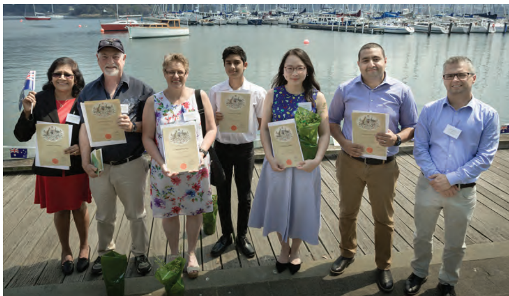
Some of the 29 new citizens of Clarence welcomed on Australia Day at Bellerive Boardwalk.

"Along with all our nominees, they are committed to their community and to helping