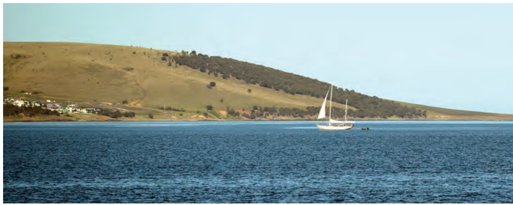
View of Tranmere.

Council has decided that a structure plan should be prepared to guide future development of the area, so that it can properly plan for factors like the visual significance; physical opportunities and constraints, including the topography;