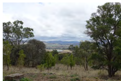
The new Brinktop Reserve and walking track offers excellent views of the Coal River Valley.