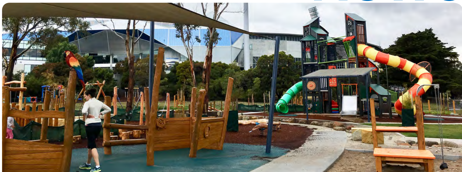
Clarence's newest playspace, Bellerive Beach All Abilities Playground , incorporates a variety of play and is an inclusive space for all ages and abilities.