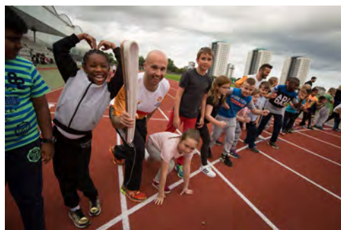
Ready, set, go: Clarence all set to host the Queen's Baton Relay on 9 February 2018.

The streets of Clarence will come alive in February when residents have a unique opportunity to witness the XXI Commonwealth Games Queens Baton Relay up close.