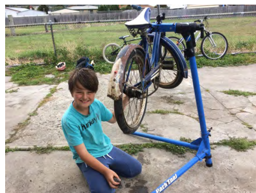
Council's bike programs aim to engage young residents in Clarence.

Money for the helmets has been kindly donated by private sponsors.