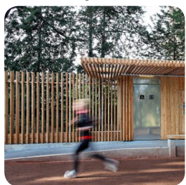
Amenities - low visual impact