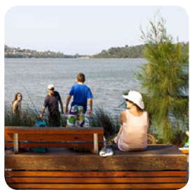
Bench seating with view