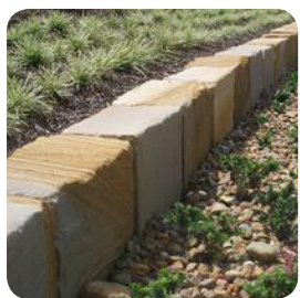
Low stone retaining wall

INTERPRETIVE SIGNAGE Information related to Pindos Park