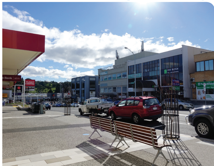
Significant improvements have been made to Bayfield Street in Rosny Park with new traffic management devices, public facilities and landscaping.