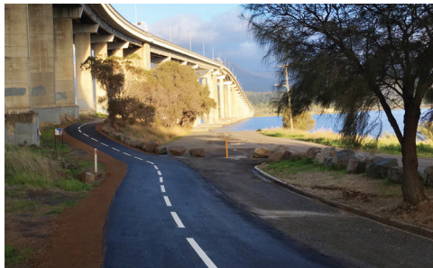
Part of the newly constructed section of the Clarence Foreshore Trail at Montagu Bay.

Council will also soon commence stage one works to upgrade the foreshore trail from