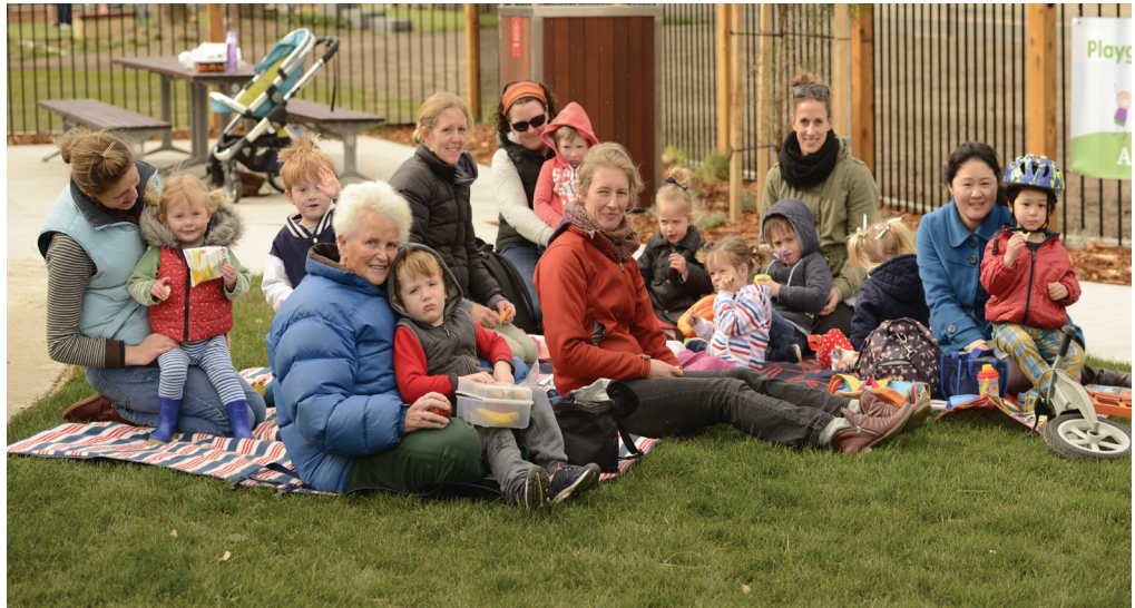
Council is leading the way with a number of initiatives and spaces for all ages to ensure we continue to be an age friendly city and community.

At the centre of the plan is acknowledging older people as a valuable resource and the commitment to including them in the planning