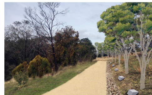
A concept design of the Avenue of Honour.

Works to be carried out include landscaping at the Quarry Road entrance, planting of 23 gum trees, a gravel track along the avenue, information signs, a sculpture, and a short extension of the Carawa Street footpath to link