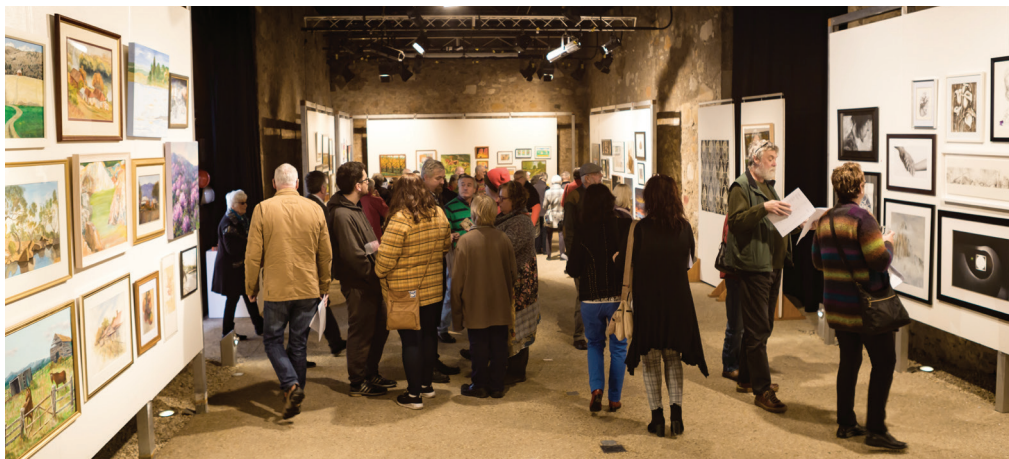
Clarence Open Art Prize recognises the creative talents of residents in the city.

Entries in Clarence's Open Art Exhibition are now open, but you need to get in quick as the closing date is 13 July.