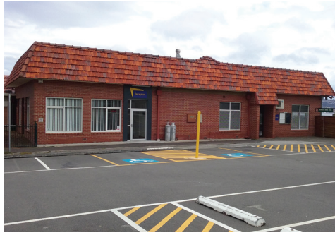
Howrah Community Centre is home to a variety of activities and is also available for hire.

Committee of Council and has recently been renamed the Howrah Community Centre. This accurately reflects the activities which operate in the precinct. The centre has a strategic plan that ensures the operation keeps pace with the needs and aspirations of the community. Council has granted the centre $75,000 to have the centre's design and layout reviewed by outside consultants. This will help make the centre's use reflect the community's expectations in the future.