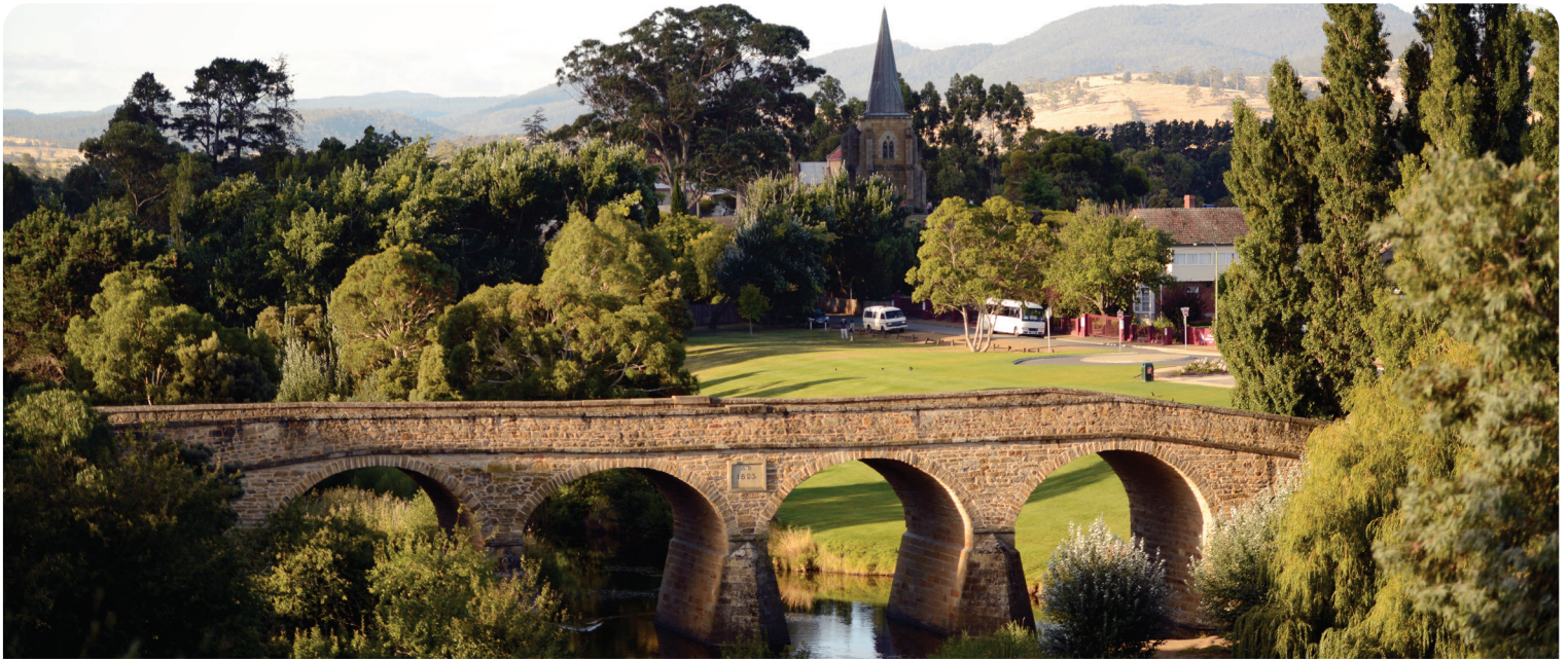
A picturesque view: Historic Richmond Bridge and St John's Church.