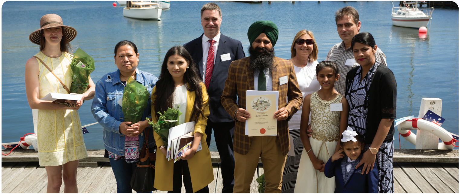
Clarence welcomed its newest citizens at a ceremony on Australia Day.