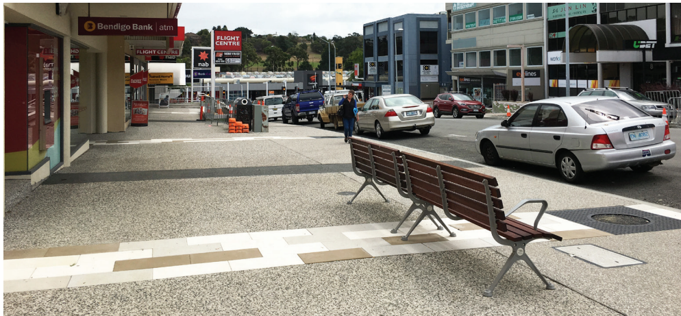
Works are progressing at Bayfield Street in Rosny Park to improve safety and accessibility.

The beautifying, modernising and overall transformation of Bayfield Street in Rosny is getting closer to completion.