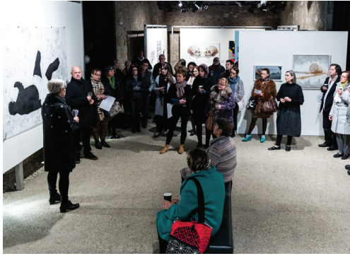
Council is looking for community members to be part of the Cultural History Advisory Committee.

Following Council's adoption of the revised Cultural History Plan late last year, Council is calling for nominations for community representation on the Cultural History Advisory Committee.